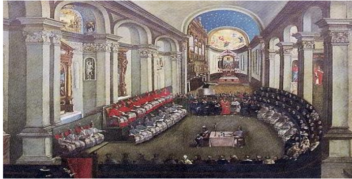
Council of Trent

Any student attending a Catholic school in Aotearoa New Zealand.